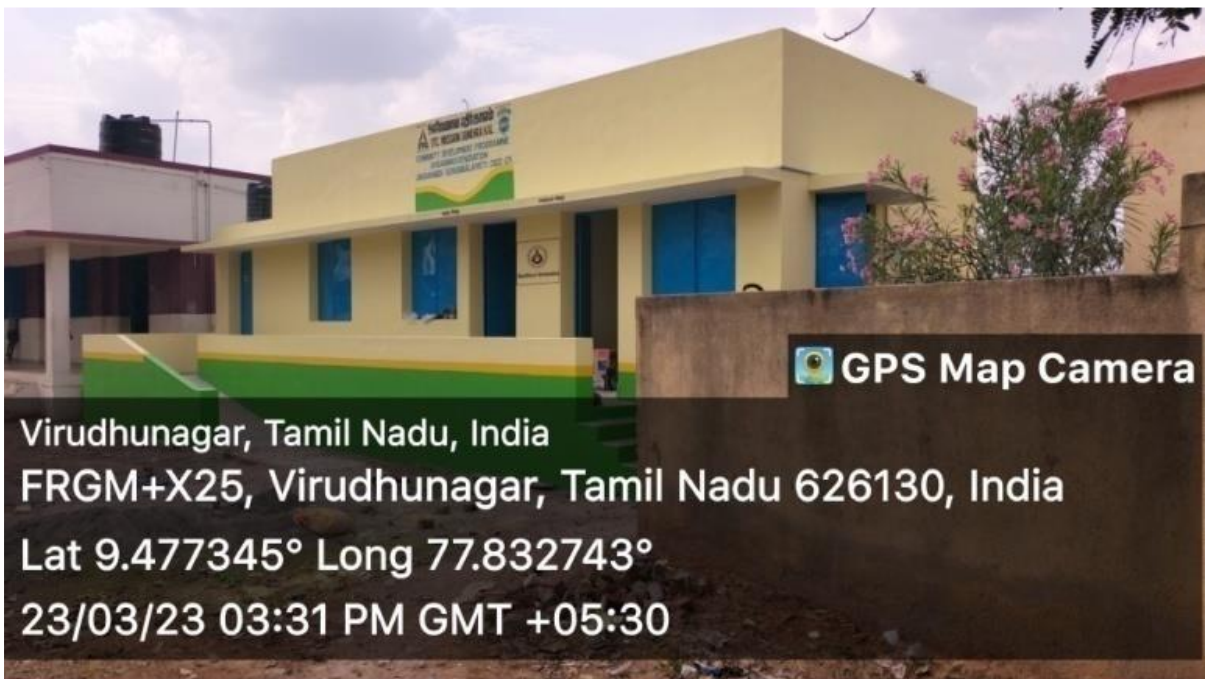
A newly renovated Anganwadi at Sengamalapatti Village -Sengamalapatti, Sivakasi Block