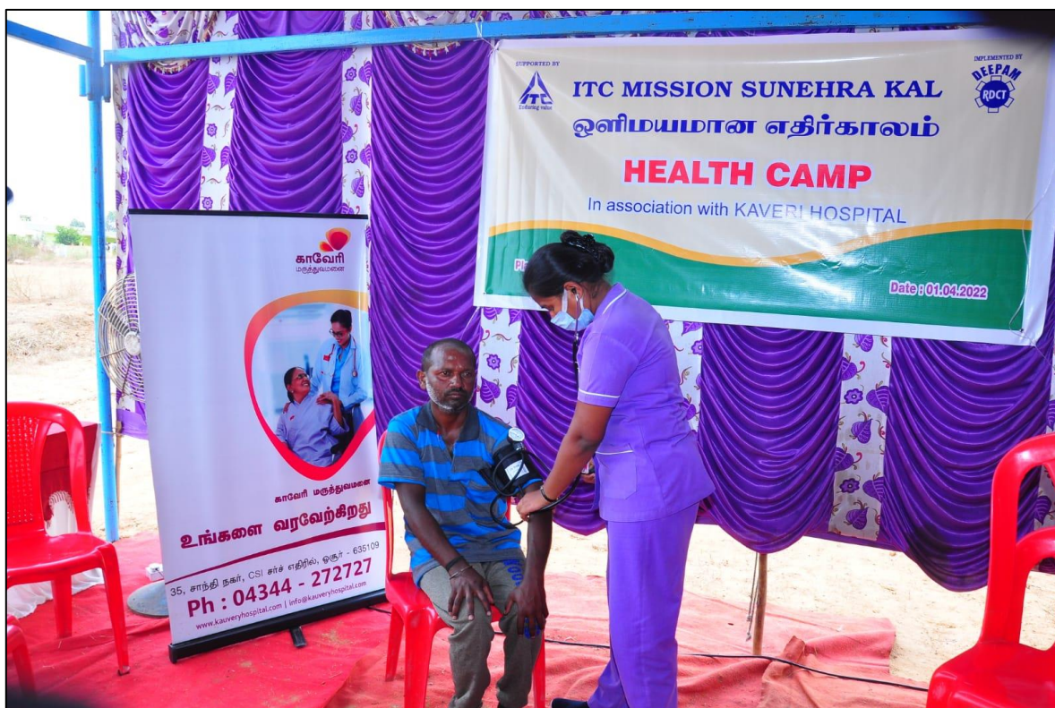
Photo of a health camp conducted in Hosur Block, Krishnagiri District