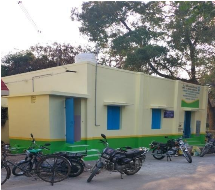
A newly renovated Anganwadi at Sivakasi -Tahi Sei Nalaviduthi, Sivakasi Block