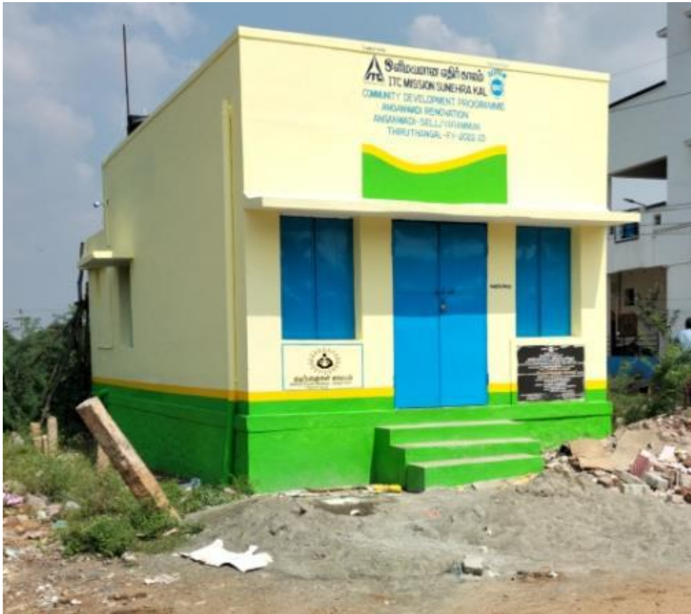
A newly renovated Anganwadi at Thiruthangal Village-Selirayamman Anganwadi, Sivakasi Block