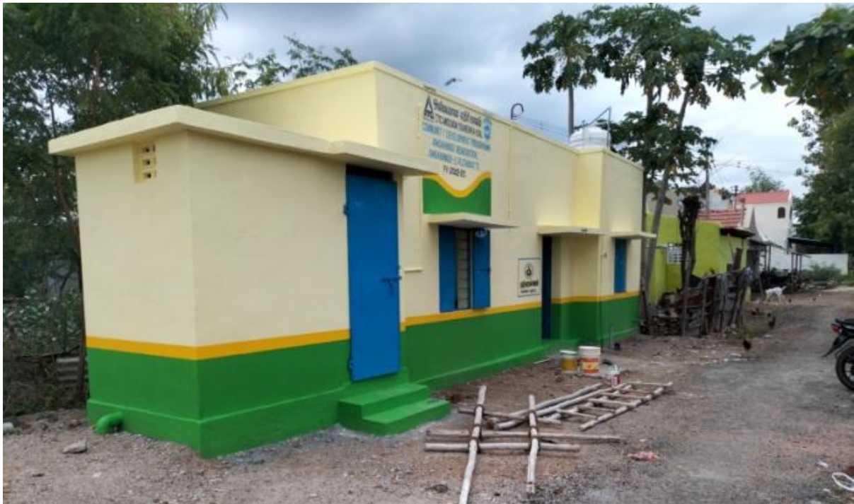
A newly renovated Anganwadi at Erichanatha Village-E.Puthupatti, Sivakasi Block