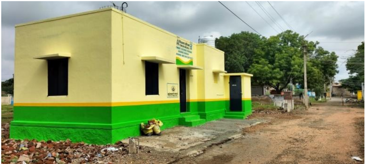
A newly renovated Anganwadi at Erichanatha Village-Ambethakar Colony, Sivakasi Block