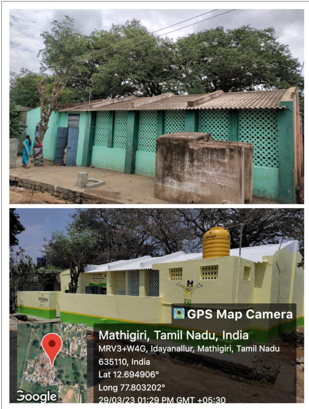
A renovated Anganwadi building at Kudirepalayam village

To ensure the quality and maintain the Anganwadis after the renovations done, we are promoting mothers committees in all the villages. The mothers committees will have its office bearers such as President, Secretary and Treasurer like SHG models. The members of the committee will be the parents of Anganwadi children and pregnant mothers those who attend the Anganwadi nutrition centre. They will also monitor and supervise the Anganwadi renovation works which will be carried out from our project. Up to FY: 2022-23, we have promoted 32 mothers committees.